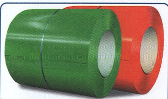
COLOUR COATED COILS