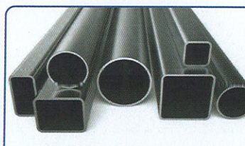
ERW MS PIPES AND GP PIPES